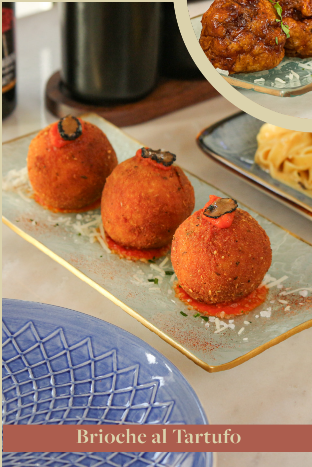
Brioche al Tartufo