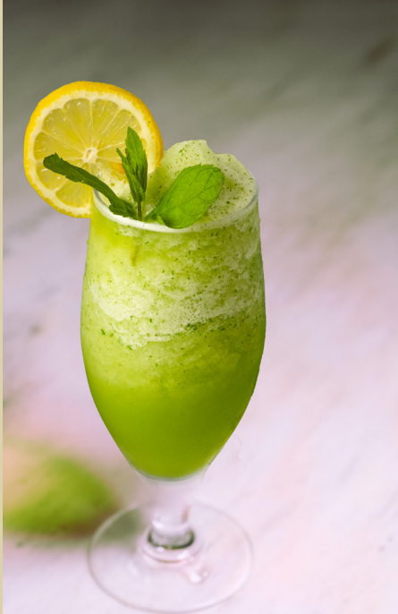
Limonata e Mento Congelata