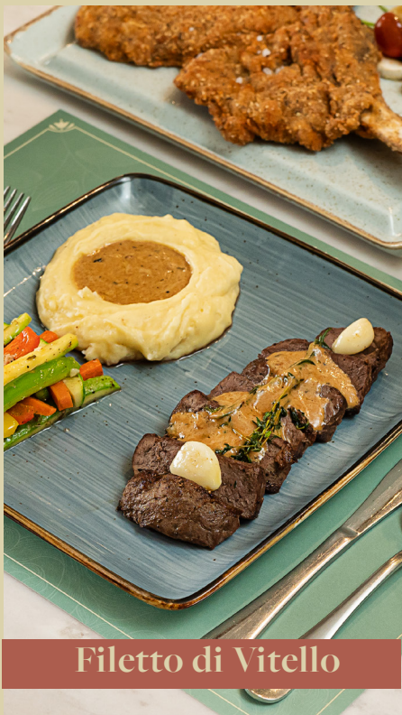
Filetto di Vitello