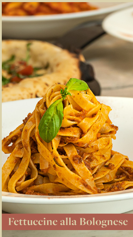
Fettuccine alla Bolognese