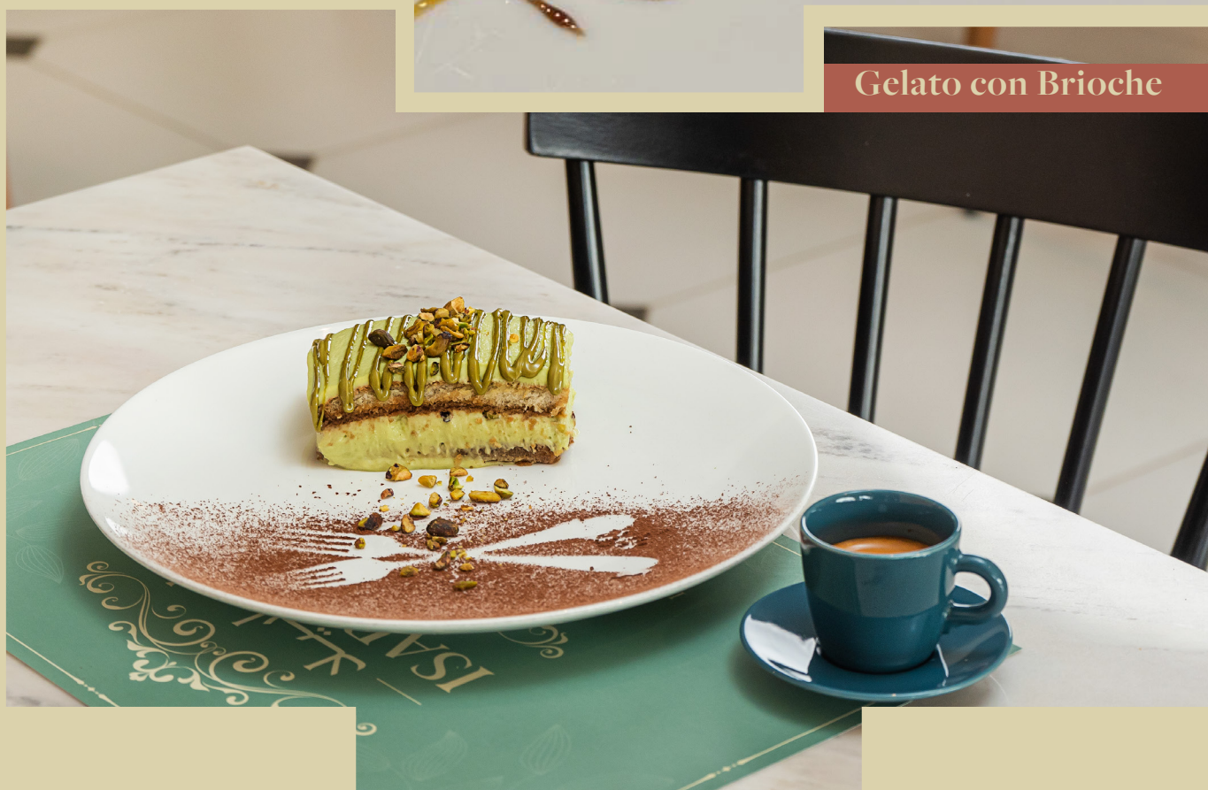
Gelato con Brioche