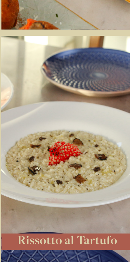
Rissotto al Tartufo