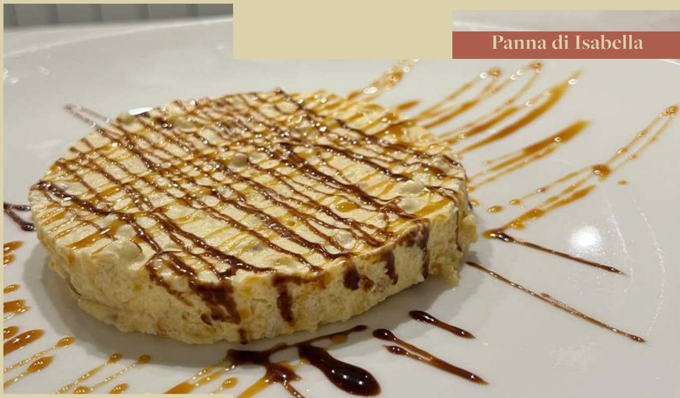
Panna di Isabella