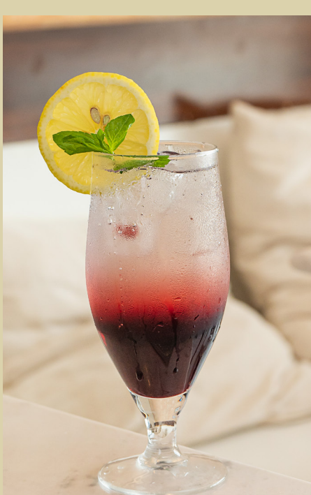
Ciliegia al Mojito