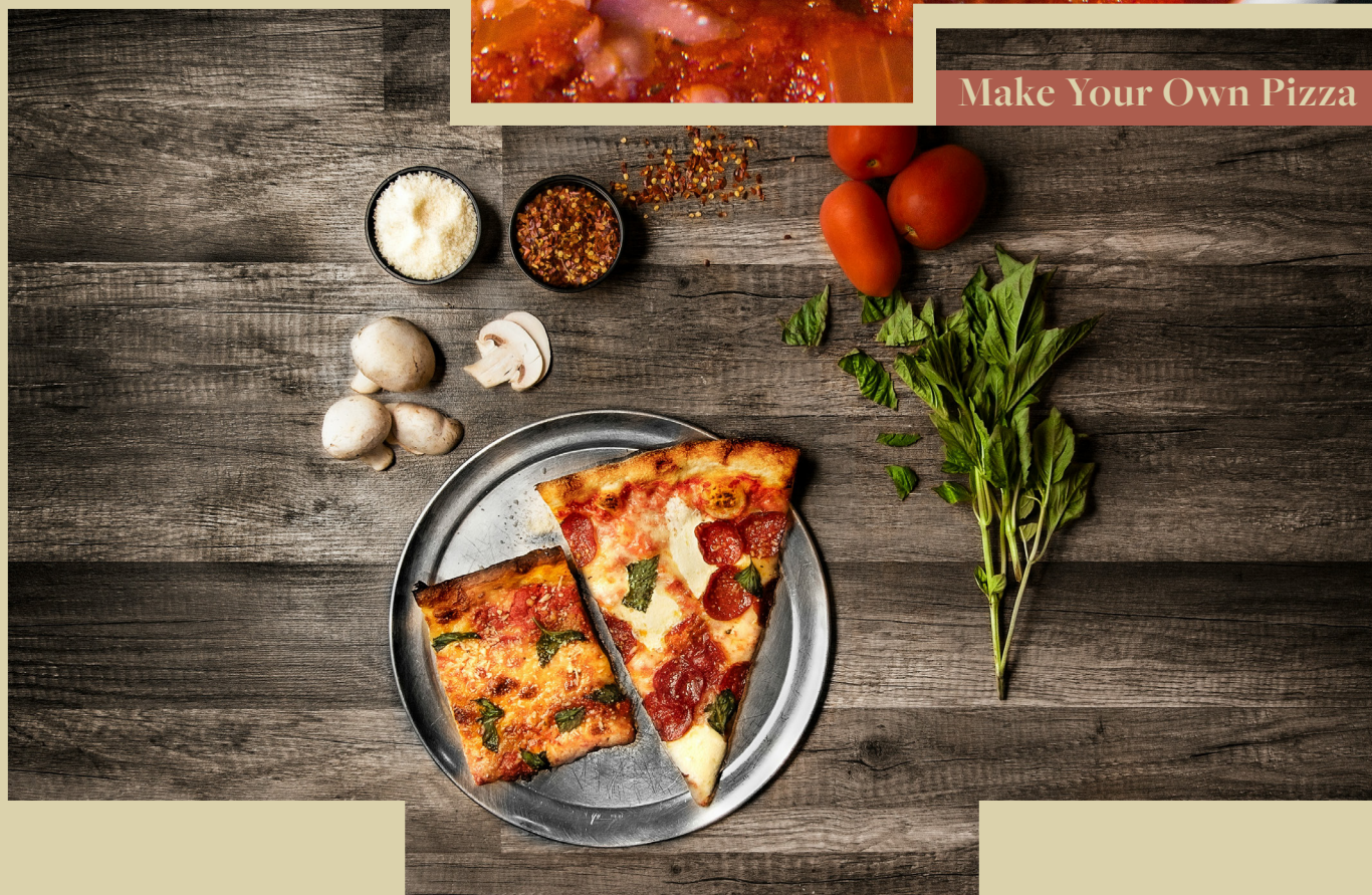
Make Your Own Pizza