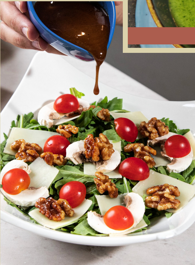
Insalata della Rocca