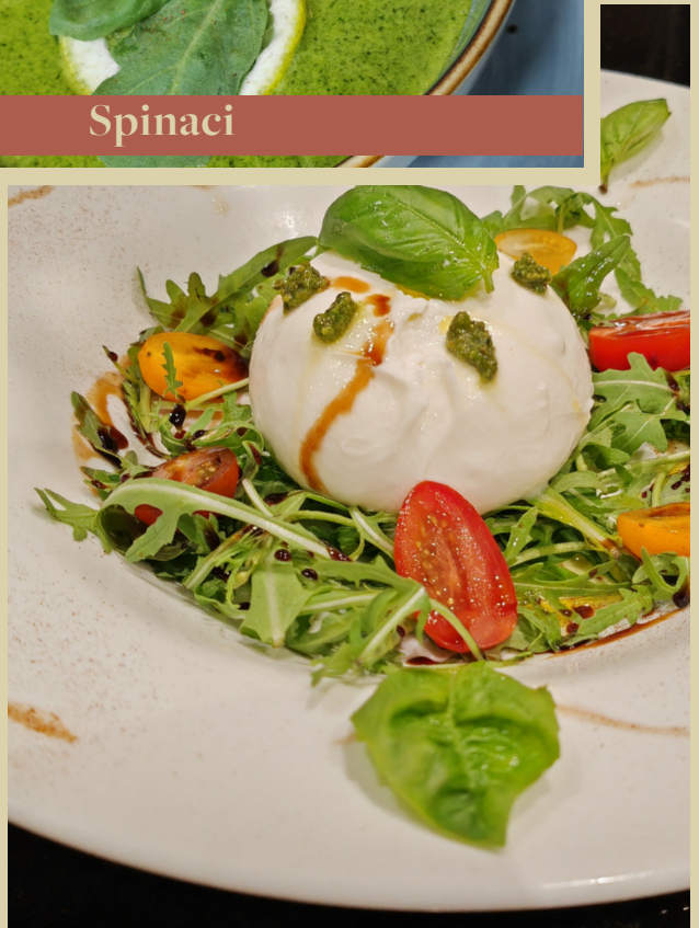
Insalata di Burata