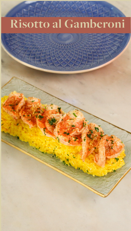
Risotto al Gamberoni